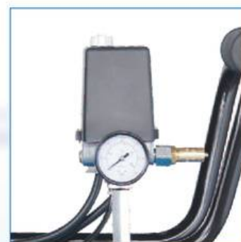
Reliable and easy to use