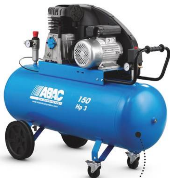
PRO A39B 150 CM3 3 hp, 150 liter