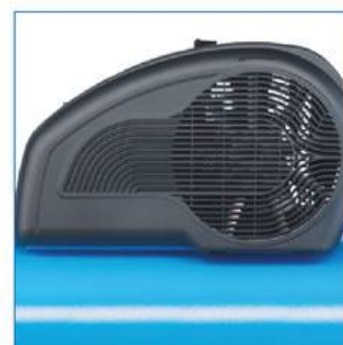
unique innovative belt guard design to improve cooling